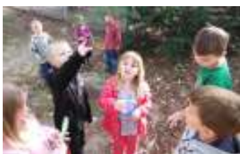
Spider Investigation Half-Day Preschool