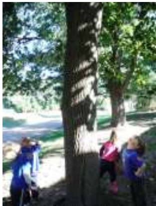
Tree Investigation Full-Day Preschool